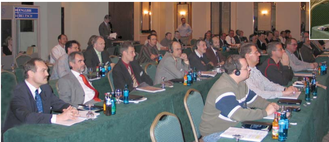
Real-time translation during European presentation.