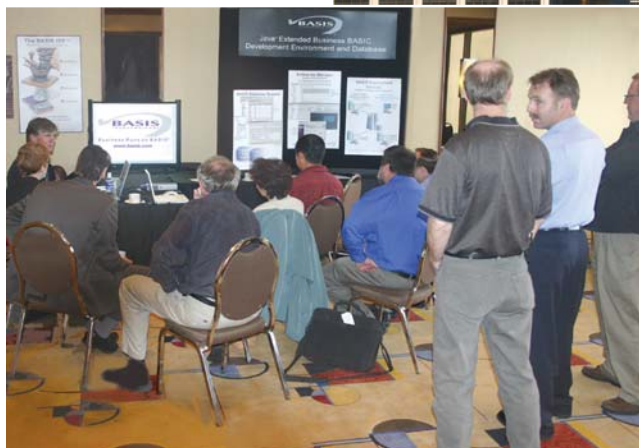
Vancouver skyline (top) and the Solutions Showcase (bottom).