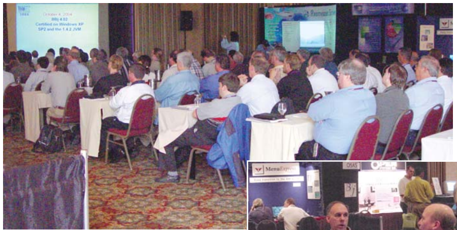
Participants attend a general session.

According to our feedback, the opportunity to network with other developers is an important part of our conferences. While we value the chance to get face-to-face with many developers at one time, apparently you also value the peer-to-peer exchange. In addition, your feedback indicated that you enjoyed the venue, so we booked TechCon2006 in Las Vegas, Nevada on May 7-9, 2006 at the brand new Marriott Renaissance Las Vegas Hotel. The razzle-dazzle of Vegas is just a few blocks away, but the ambience inside is like any four-