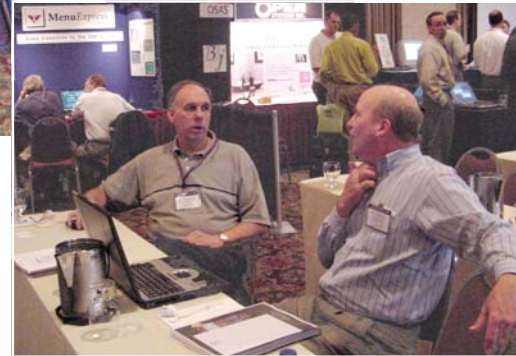
Colleagues and exhibitors network.