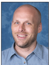
By Jeff Ash Software Engineer

A very common problem for application developers to consider is how to update an older installation so that it is compatible with a new version of the software. If it were a simple application such as a word processor or spreadsheet application, they could just install the new application files and everything is ready to go. However, with database-driven applications, this is not usually enough; developers must also update the database to hold new data required by the new version and the addition of new tables to the database. To further complicate things, the database used with the old version may have customizations that make it difficult to simply copy data from the old tables to the new ones.