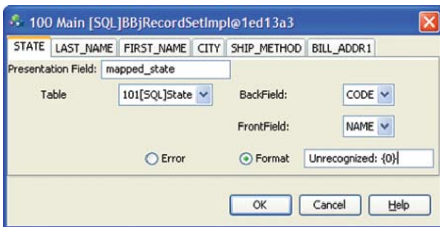
Figure 3. Mapping Editor Dialog in FormBuilder

The Chile Company database already contains a table STATE, which maps two-character state codes to full names. The database also has a table SHIP_METHOD that maps the five-character shipping codes to their full names. FormBuilder provides a dialog ( Figure 3 ) to add mappings to a BBJRecordSet, the data from which the FormGen Wizard can then create the application. BASIS also expanded the API with new methods to add mappings.