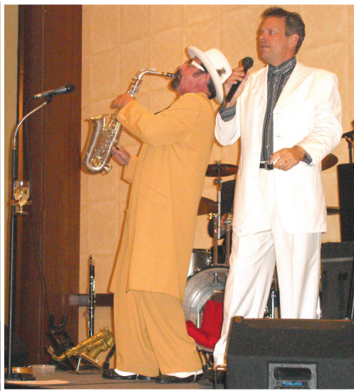
Monday evening's entertainment